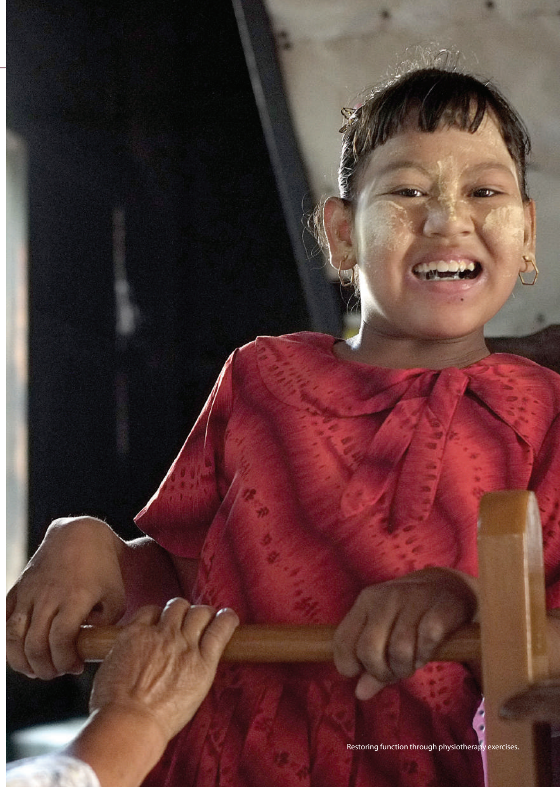
Restoring function through physiotherapy exercises.

SAT/SUN: Please pray for the visitors from World Servants who will be generously volunteering their time and energy to support MCLH this August. Pray that God watches over them, and that they and those they are serving experience the love of Christ through their work.