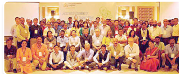
TLM India staff and colleagues at their Annual Country Learning meetings 2016.

SAT/SUN: Wellesley Bailey, our founder, said that prayer was at the basis of every good thing that TLM was able to achieve. Give thanks today for people like you, around the world, who uphold the Mission's work in prayer. Pray too that, as Jesus taught, our persistent prayer will open doors and opportunities that otherwise seemed impossible.