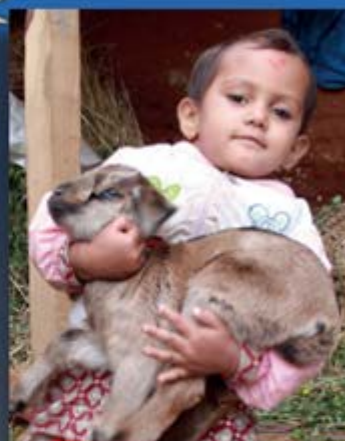
A Goat p.20