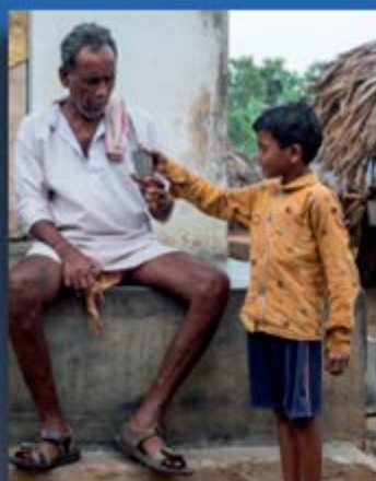
The Gift of Sight p.10