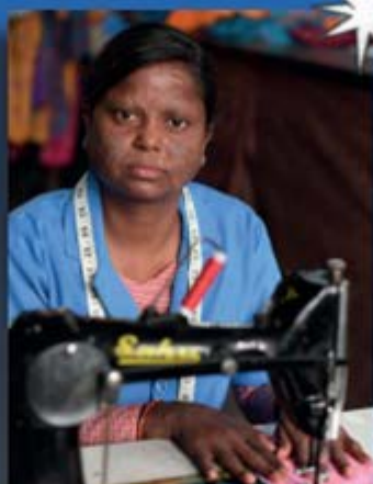
A Sewing Machine p.19